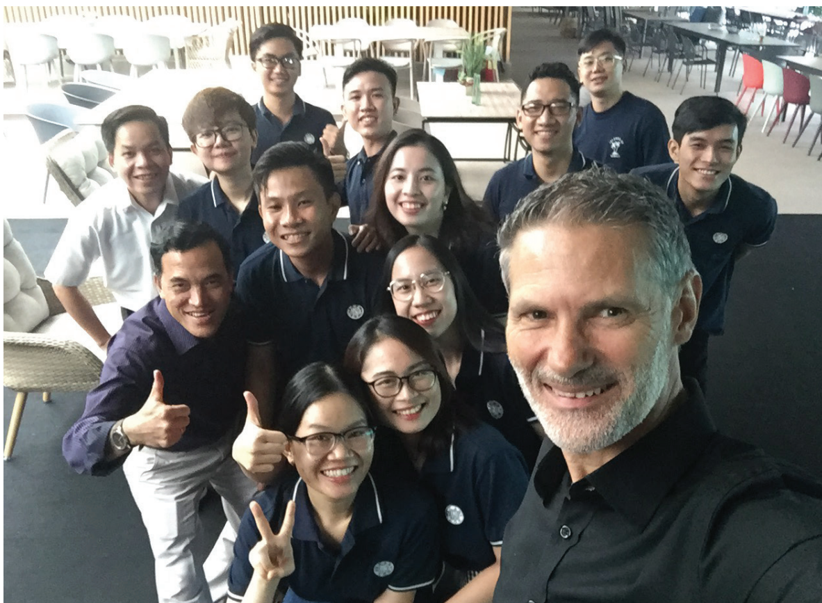
-ScanCom Trainee Management Program

In season 18/19, the period was from July 18 to August 19 with 14 months and season 19/20, the period was from September 19 to August 20 with 12 months. In order to compare between the 2 seasons, some of the average training data in 12 months of season 18/19 was used here for computation.