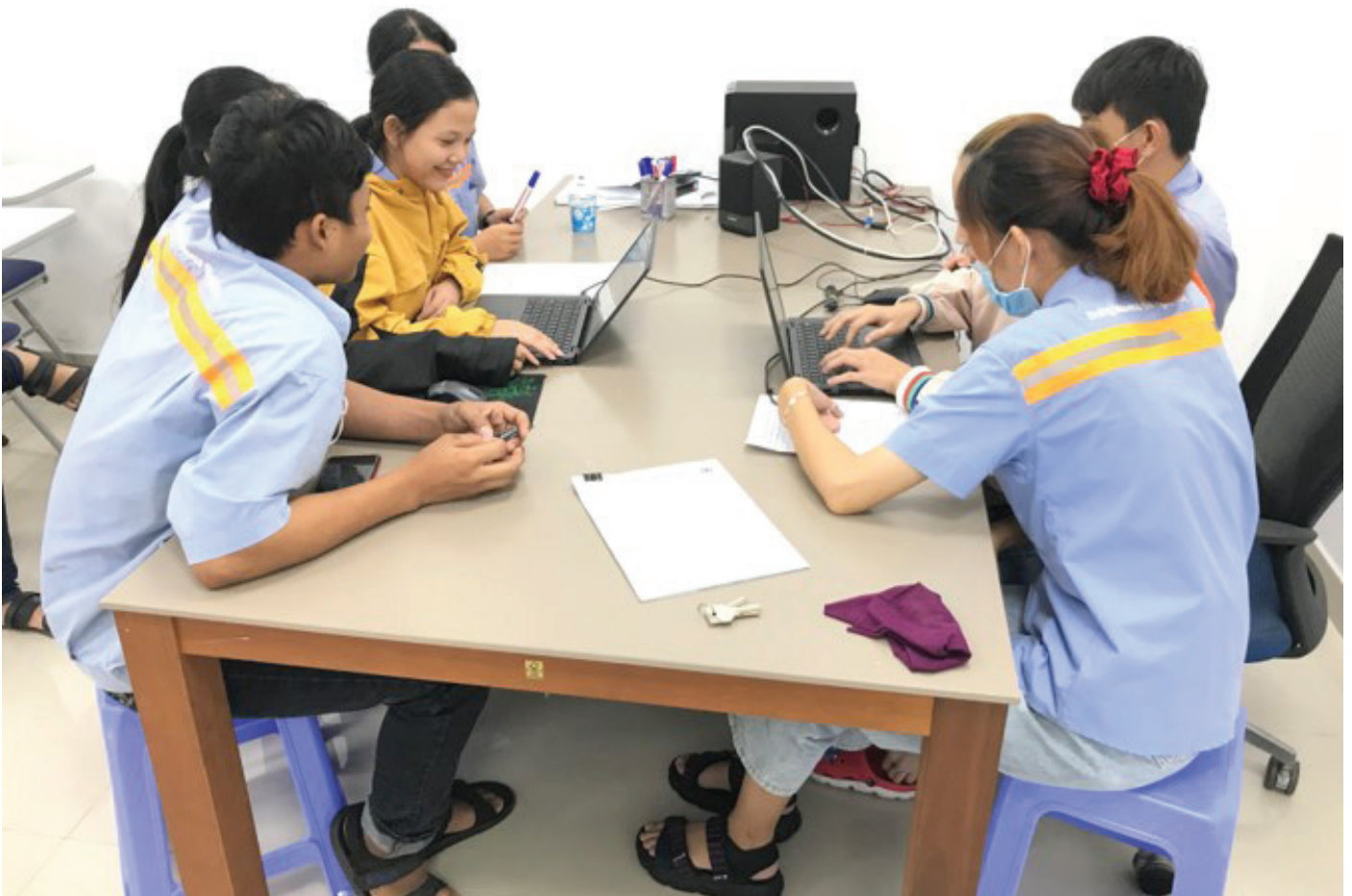
ScanCom Young Worker Development Program.