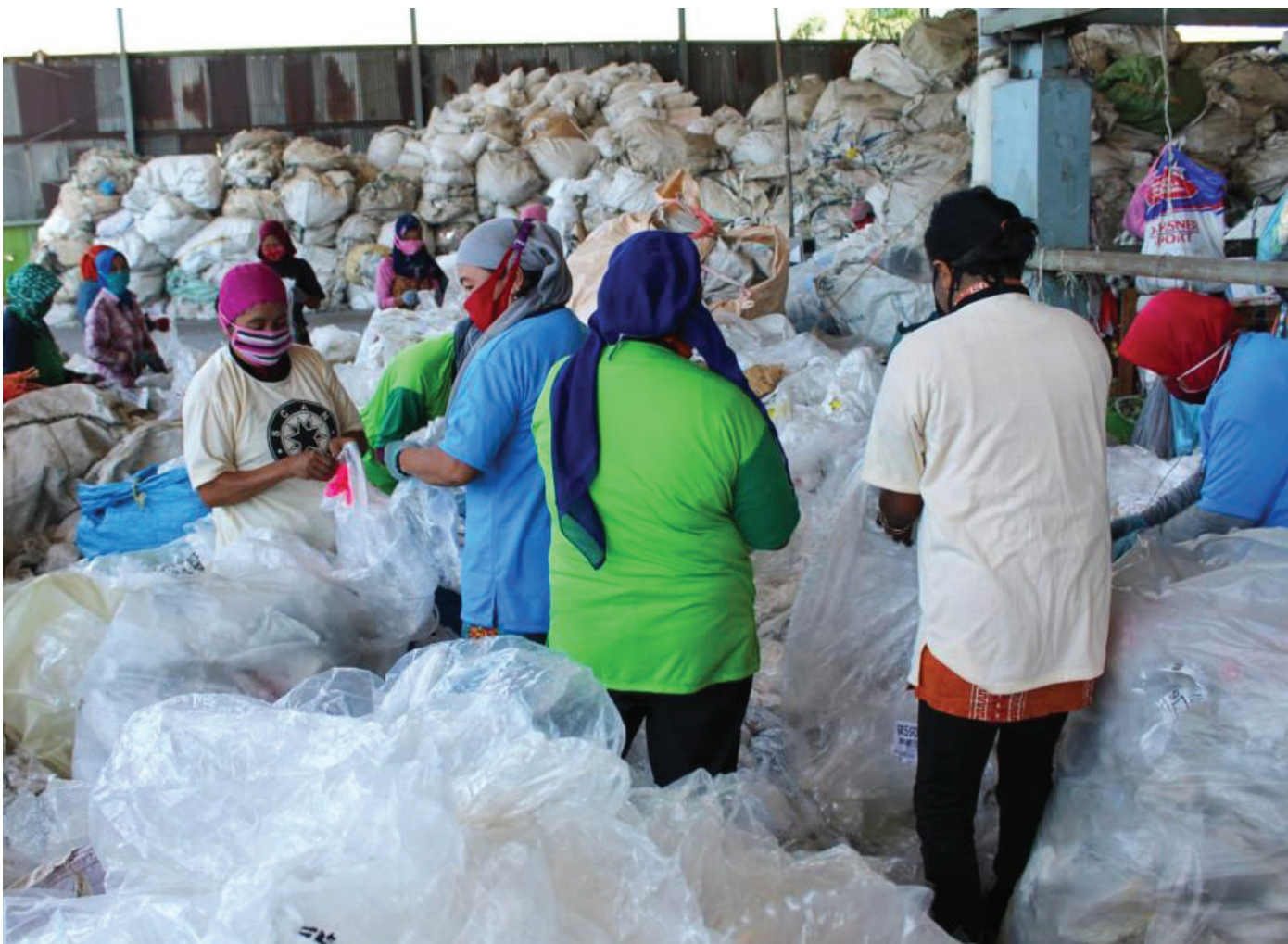
-Marking the partnership with Plastic Bank, ScanCom Indonesia visited a collection point to see the sorting operation for the Social Plastic® material.

As to the direction of sustainability strategy, ScanCom has also focused on materials used for production and starting to source with suppliers for high volumes of recycled material with the purpose of achieving a reduced impact to the environment and the climate change. This is further compounded with the reintroduction of 'waste' materials from our own production facilities.