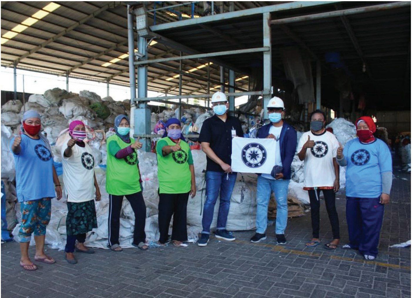
-ScanCom Indonesia at Plastic Bank collection point.