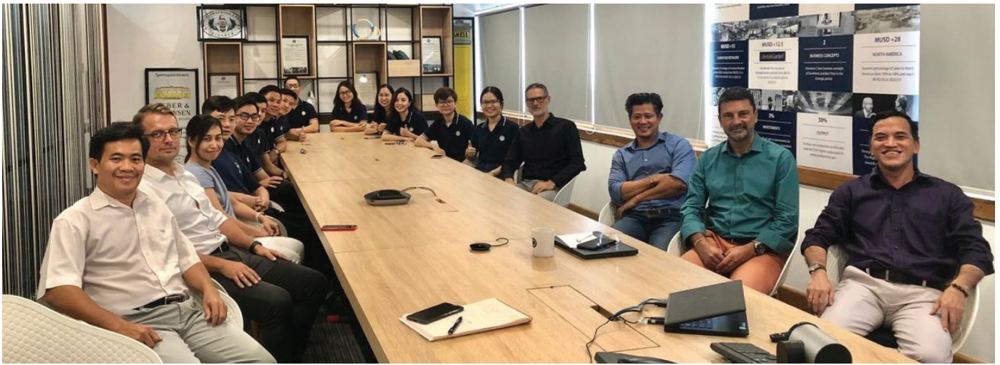
-ScanCom Trainee Management Program